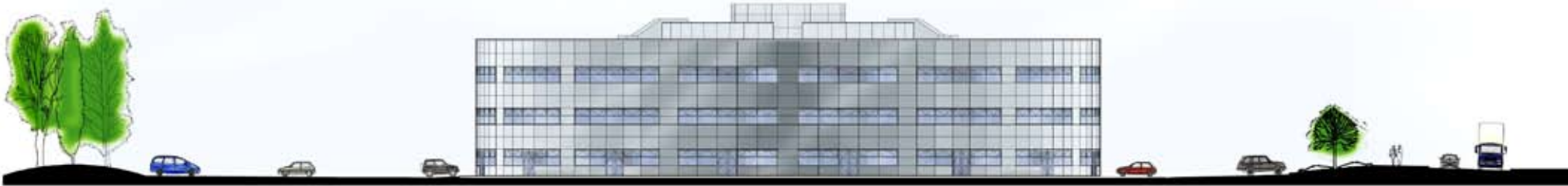
ELEVATION TO NORTH EAST